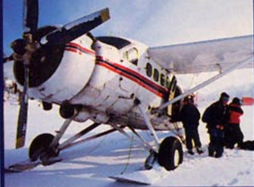
The single-engine Otter, with ski-equipped landing gear, flies to slopes a helicopter cannot reach.