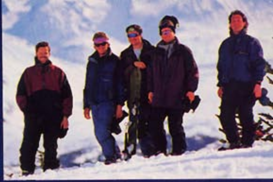
Heli-skiers duck to avoid an unkind haircut. On a summit, the Austrians line up for a team photo.