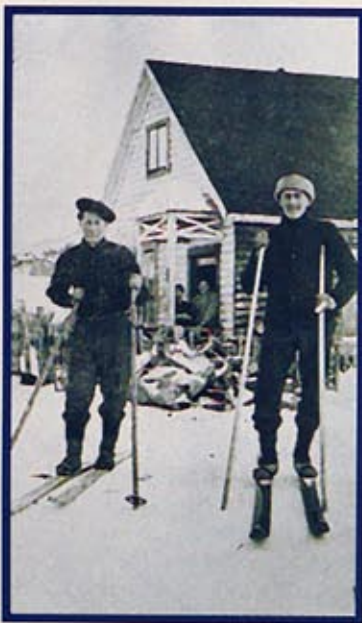
Atlin's first skiers were prospectors and residents on old wooden boards.